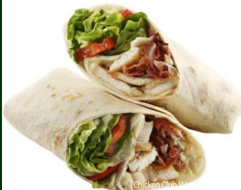
Chicken Club Wrap