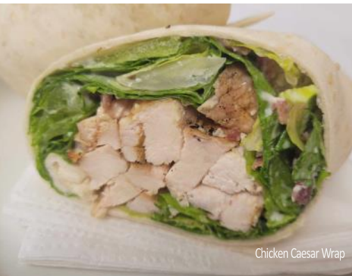
Chicken Caesar Wrap